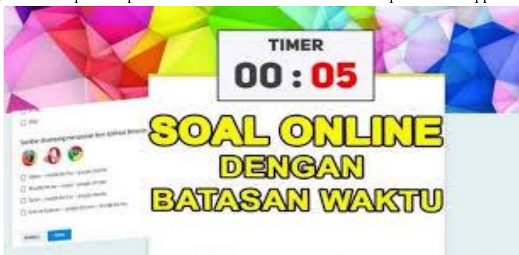
Figure 1. Image Above is One Example

From table 2 above, it can also be seen that only a few students chose to disagree, namely only 14%. Very few students disagree that this quiz creator application will make it difficult for students and teachers in the learning process. There are also many students who disagree if this quiz kreator application can be used properly in assessing student achievement in elementary schools. It can also be seen that students disagree with the statement that this quiz creator application can make students lazy to learn. In addition, there are also many students who disagree that this quiz creator application has many negative impacts on elementary school students. Because then it can be ascertained that this quiz creator application can increase students' enthusiasm for learning and have a positive impact on students. It can also be ascertained that this quiz creator application can increase student creativity in using technology and combine it with education. With this quiz kreator application, students can also keep up with technological advances that are increasingly developing in the world of education today. The features contained in this quiz kreator application are also interesting and numerous so that they can increase students' interest in learning. The following is an example of a picture of the features contained in this quiz kreator application.