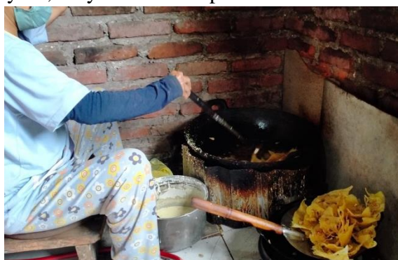
Figure 2. Process of making peanut brittle

The peanut brittle business activity can produce up to 6 kilos of dough every day and make 6 – 8 large jars. He has no employees, only with the help of his children.