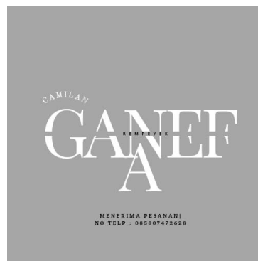
Figure 4. Brand Logo

To make his products he uses tools and materials such as pans, spatulas, scoops, basins, knives, rice flour, starch, salt, turmeric, flavorings, garlic and lime leaves. The process of making peanut brittle takes 3 – 4 hours using 2 large frying pans. The marketing implementation of peanut brittle follows the 3 P principles, namely, high quality products, correct pricing and a clear market. In line with consumer demands from parties involved in the marketing of peanut brittle, for this reason I created a brand logo affixed to the peanut brittle packaging.