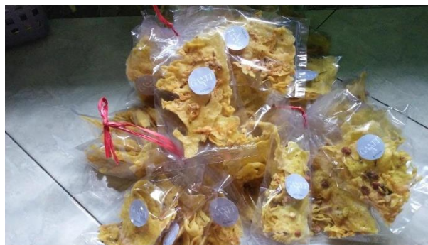
Figure 5. After creating the logo

Technological developments can be used to support the quality of a company so that it can develop and survive, for example by creating a new brand logo so that people are more familiar with its products. The packaging is still very simple, indicating that packaging technology has not been implemented. Quality products must be supported by attractive packaging. This condition becomes a weak point for GANEFA to market its peanut products when the product appearance deteriorates. In fact, product packaging really determines product marketing.