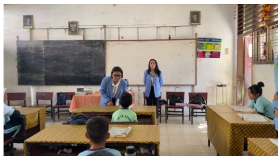
Figure 4. Question and Answer Session

When giving questions there are students who are active in conveying questions to the presenter. There are also students who actually want to ask/answer but they lack the confidence to submit questions and answers.