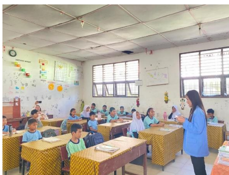
Figure 2. Participants participating in the socialization

This activity was attended by 20 fifth grade elementary school students and 1 English subject teacher as well as 6 presenters who will deliver socialization material on the topic of the importance of building English skills for elementary school children based on the lesson plan that has been prepared.