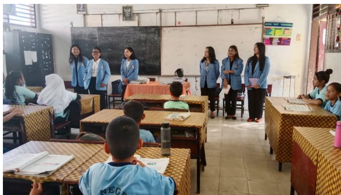
Figure 3. Self-introduction by the Team

In this phase the activity is broken down into 2 stages, namely delivery of material or modules and a question and answer session.